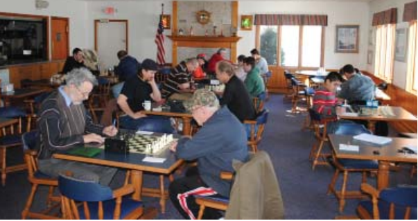
Sixteen player compete