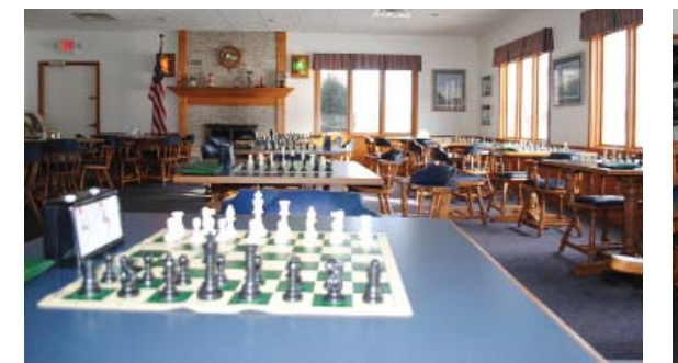
Quiet before the storm; the dinning room set up for the tournament