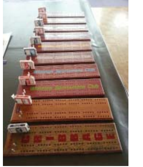
All lined up and ready for play