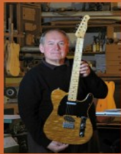
Music by Kip

We make the Salad, Baked Potatoes, Baked Beans, Mushrooms & Gravy and Dessert for $10.00/per person