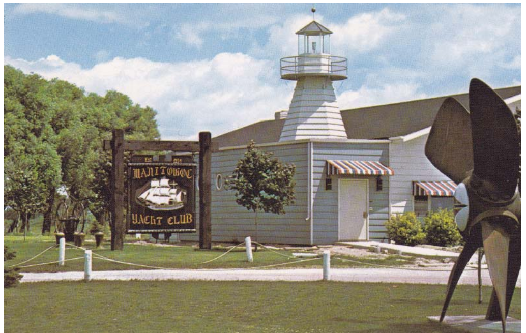
An old postcard of the club.