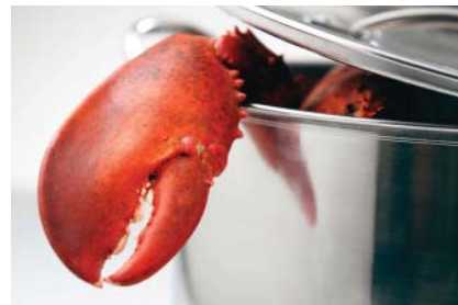
Watch for Lobster Boil Details in the September Waves!