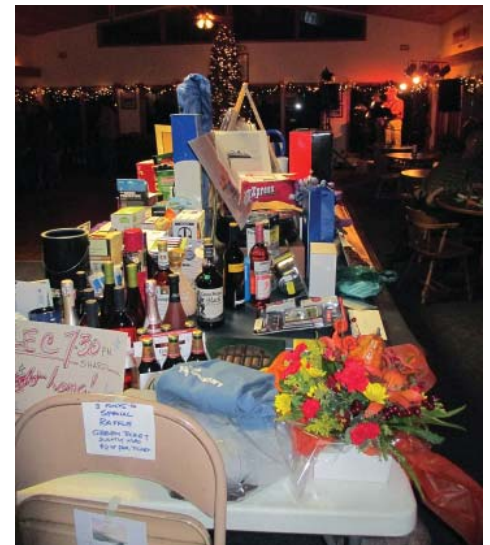
Thanks to everyone who donated raffle prizes! We had a wonderful selection!