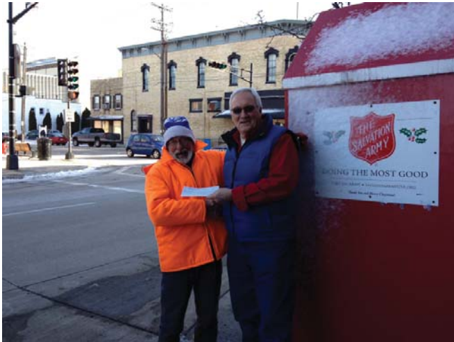
Club Donation to Salvation Army