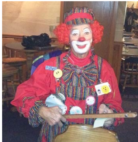
Turns out it was the clown!