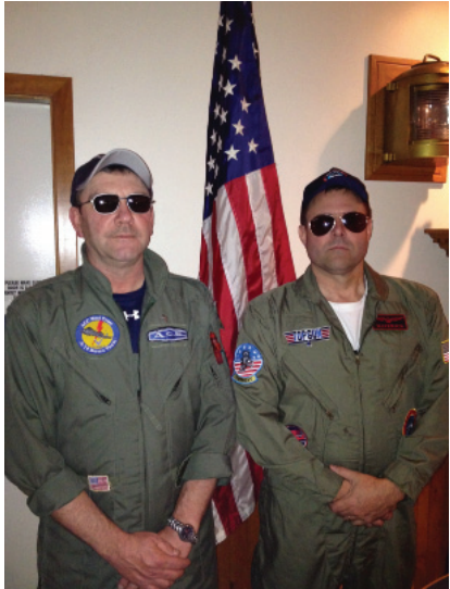
Halloween Party - celebrity pilots - can you guess who they are??