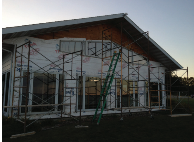
Window Replacement in the White Swan Room