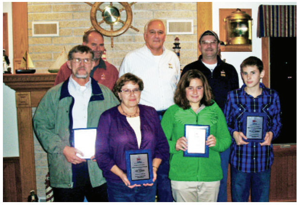
Sailing Program Participants