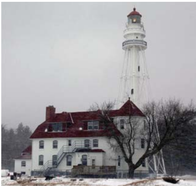
Rawley Point - Lighthouses of Wisconsin http://www.wisconsinharbortowns.org/

A major feature of Point Beach State Forest in Two Rivers is Rawley Point lighthouse. The US Coast Guard has operated a lighthouse here since 1853. The first lighthouse was a brick tower and home that served mariners until 1894, when a new steel tower was installed. The light is atop this steel tower which rises 113 feet above the lake surface and is one of the largest and brightest on the Great Lakes. It is visible up to 19 miles away and operates from one half hour before sunset until one half hour after sunrise. The old brick light tower was cut down, roofed, and became a part of the keeper's house. These structures, framed by evergreens and a blue sky, have become a scenic attraction in Wisconsin. Before the new lighthouse was built, 26 ships foundered or stranded on the point. They included 20 schooners, a barge, two steamers, and three brigs. The most tragic sinking in the point's unpleasant history occurred in 1887, when the steamship Vernon went down in heavy seas. One of the largest, steamers on the lakes at the time, the Vernon took 36 crew members and passengers to their deaths. The sinking remains a mystery. Since the lighthouse went into operation, however, the tragedies have come to an end.