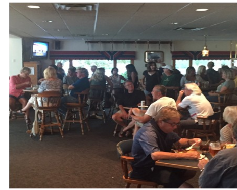
Envelopes ready for Pay your dues party!