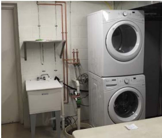
Laundry has been installed in the basement