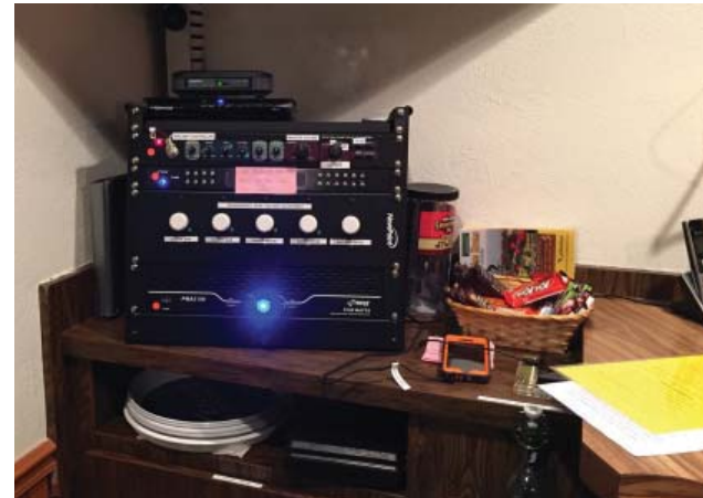
New stereo and sound system. Please refer to yellow sheet for instructions. The tuner for the radio will be installed soon.