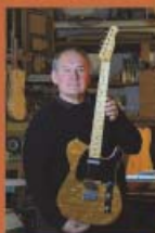
Music by Kip

We make the Salad, Baked Potatoes, Baked Beans, Mushrooms & Gravy and Dessert for $7.00/each