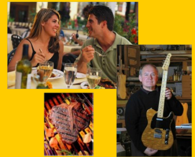
Music by Kip

You bring your own Steak, Chicken, Pork, Fish or whatever you wish to grill Both the inside and outside grills will be available