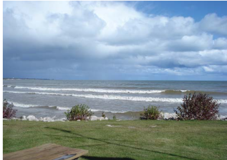
Windy October Day on the Lakeshore