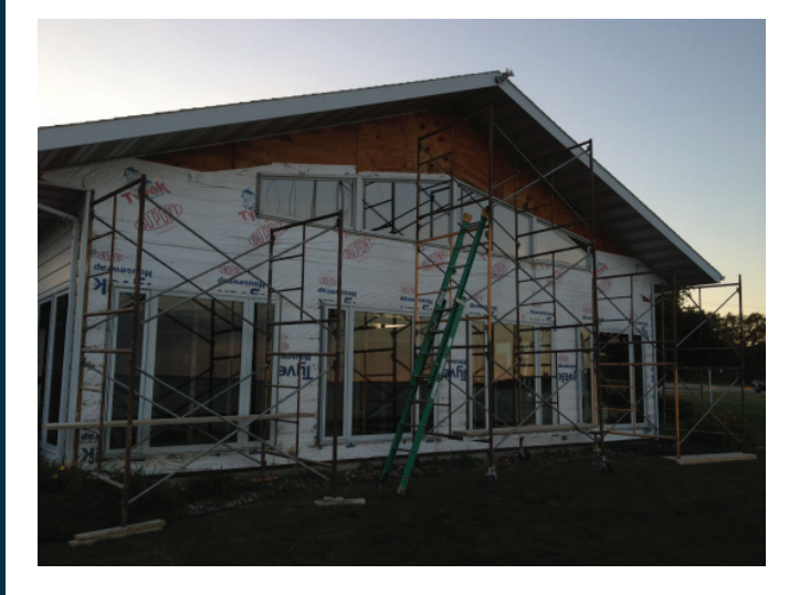
Window Replacement in the White Swan Room

Thank you to everyone who contributed photos this month!