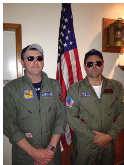
Halloween Party - celebrity pilots - can you guess who they are??

Thank you to everyone who contributed photos this month!