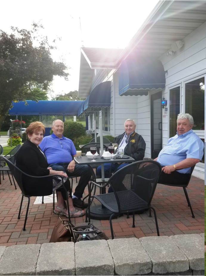
Guests enjoying the outdoors! The gentlemen on the right are visiting from Arizona!