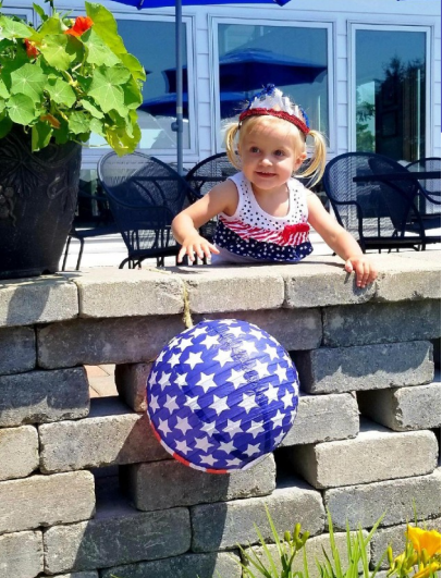
4th on the Shore at the Yacht Club!