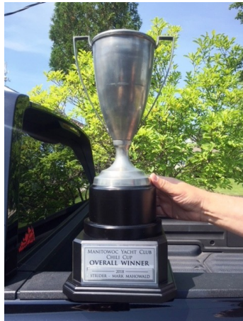
The Chili Cup Trophy engraved!