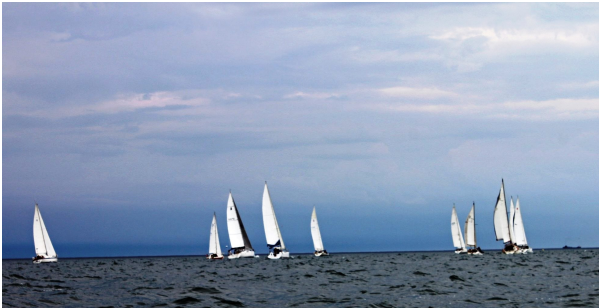
Chili Cup Sailing Rally Photo: The start! 10 boats cross the line and head for the first mark.