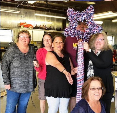
Chili Cup Race and decorating the float for the Fourth on the Shore!