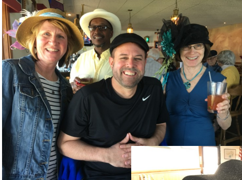
Kentucky Derby Party & Ladies of the Yacht Club!