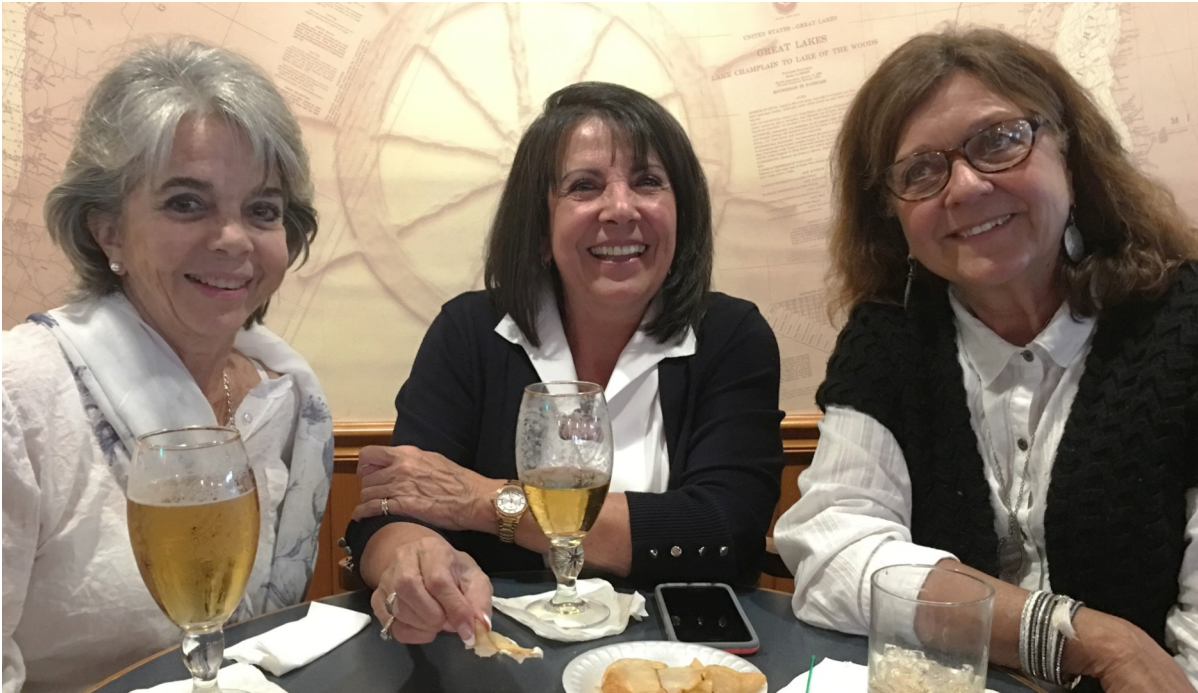
Friday Night Dining Fun!