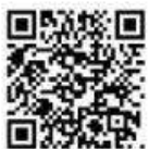
Mother's Day Brunch Volunteer Sign-up

Give the QR codes a try & signup to volunteer today!!!