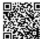
Derby Party Volunteer: signup

Stay informed: Attend the Monthly Membership Meetings! The 2nd to last Tuesday of every month at 7:00 pm.