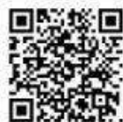
4 th on the Shore Volunteer Sign-up