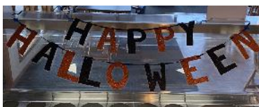
October Steak Night