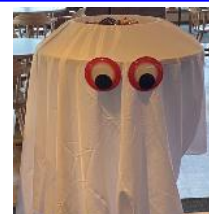
October Steak Night